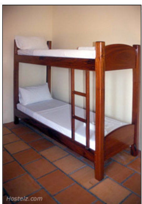
Additional photos provided by the accommodation:

★ The disaster that we face when we reach the guest house was the amount that have been agreed on the website doesn't tally with the amount shown in the guest house. They claimed that the